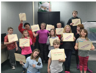
Spy Kids Club!