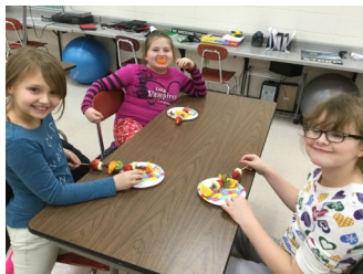
World Traveler Club!