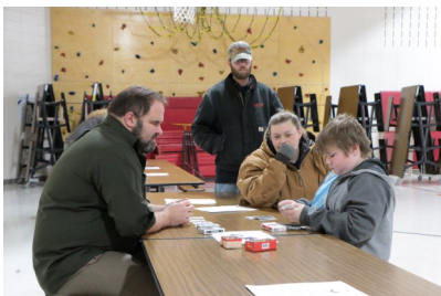
Family Math Night fun!