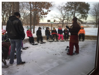
Visit with Rangers— NNWR