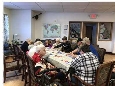
MS visiting with friends @Oak Grove Visit Naturalist @Upham Woods

THANK YOU FOR SIGNING OUT YOUR CHILD WHEN PICKING UP YOUR ELEMENTARY ASP STUDENT! THE CLIP BOARD CONTINUES TO BE LOCATED ON THE FIRST TABLE IN THE ELEMENTARY COMMONS.